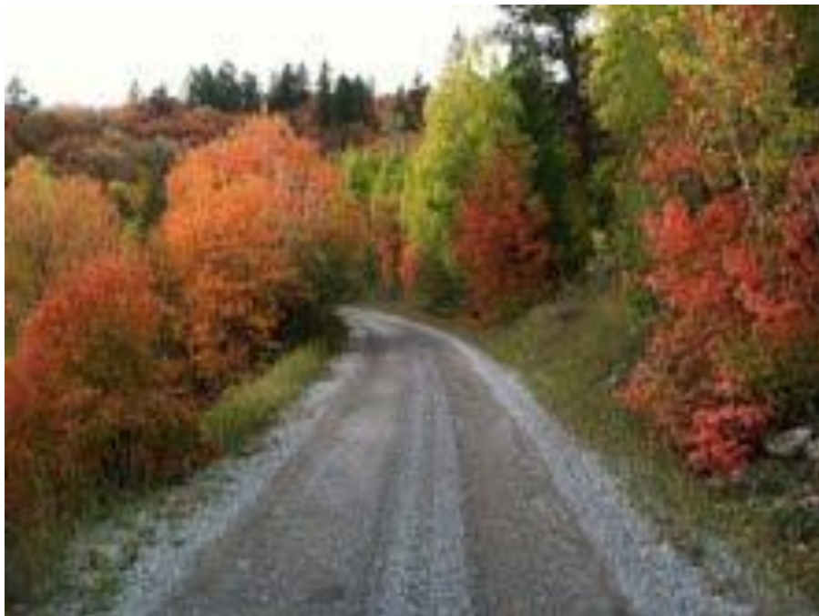
Eleven cars explored the back country east of Idaho Falls - all part of the Hiking, Walking and Exploring activities.