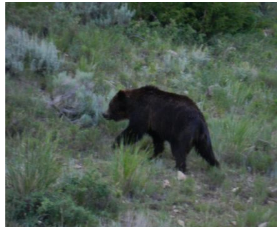
Scarface, thought to be the oldest Grizzly in the Park